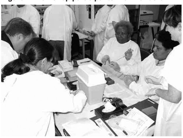
Figure 2. Workshop participants with 'hands-on'.

The DVB panel included four measles IgM confirmed cases and two other positive samples: one from a recently vaccinated child and the other a convalescent sample from a patient with measles who had seroconverted to IgG but whose IgM was no longer detectable in serum. All other samples, including four samples that were rubella IgM positive and one that was human parvovirus B19 positive, were measles IgM negative.